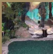
t-rex cafe installation

The recycled rubber is chopped and cut into one of three primary products: Soft Rock for landscaping, Safe Rock for playgrounds or Rubber Crumb for athletic fields and other applications. The rubber is then treated with a new-age EPA approved adherent paint that is available in eight dazzling colors. The end product is a cost-effective rubber mulch that simultaneously promotes the environment and provides a beautiful, durable landscaping alternative or an eye-catching playground surfacing that is the cleanest and safest on the American market.