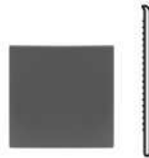
No Toe: Adds a decorative touch to carpeted